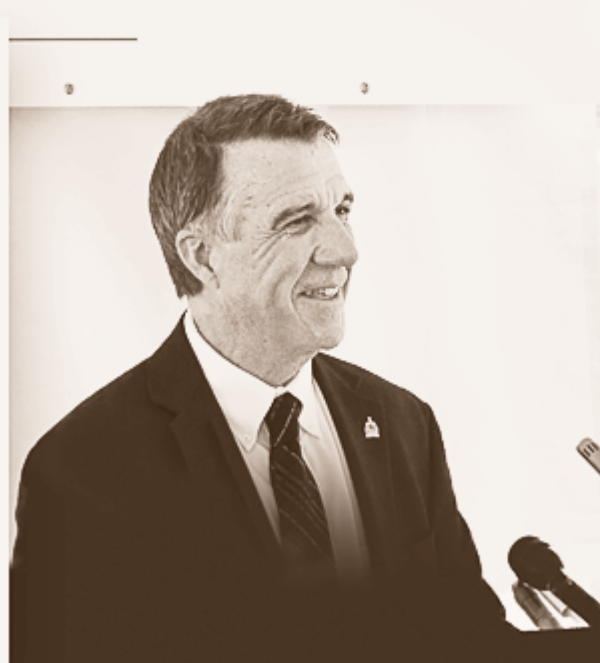
Governor Scott addresses the crowd in South Burlington to announce increased funding for housing.