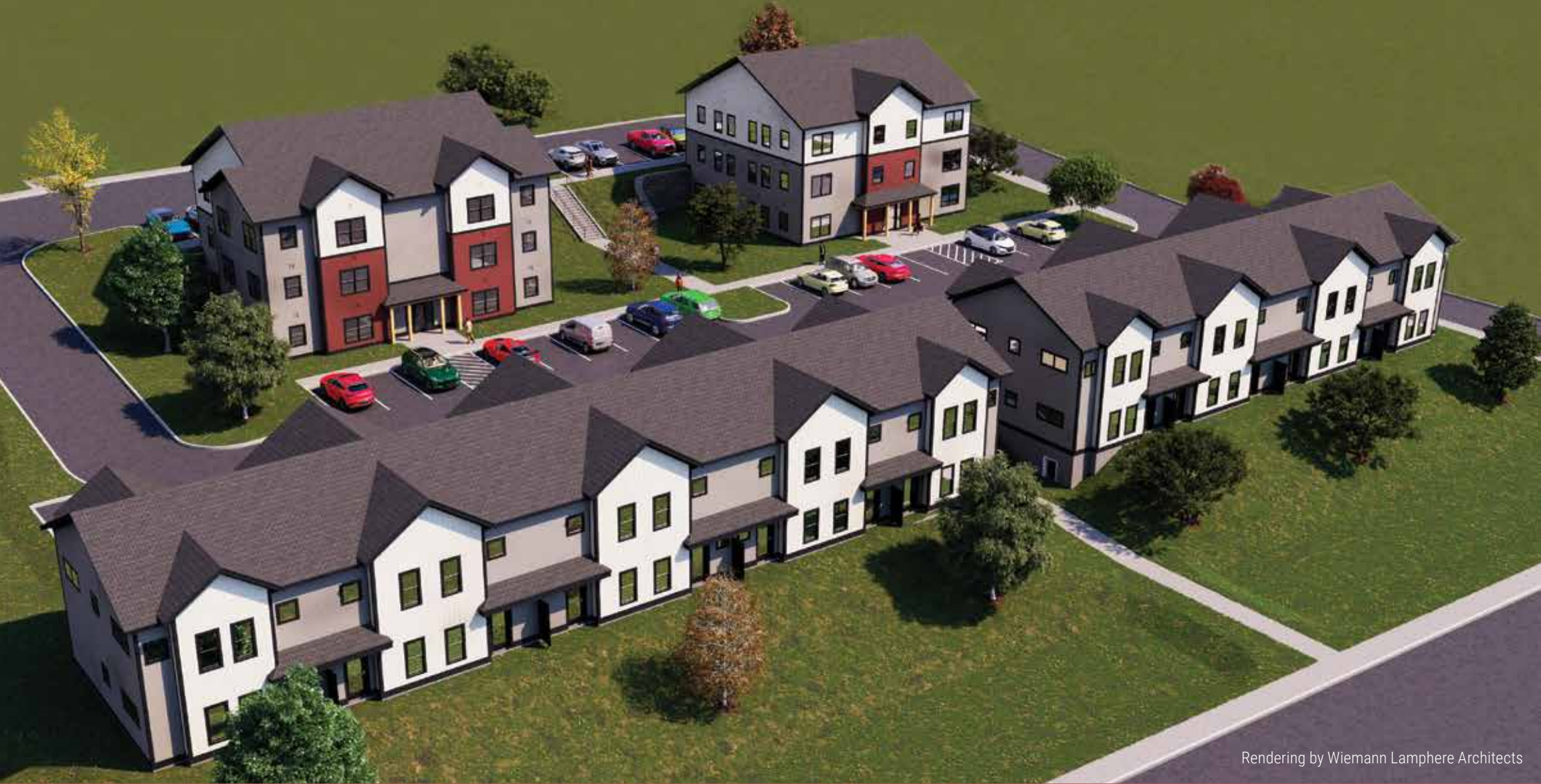
Rendering by Wiemann Lamphere Architects